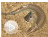
Fish "Walks" on Beach to Spawn