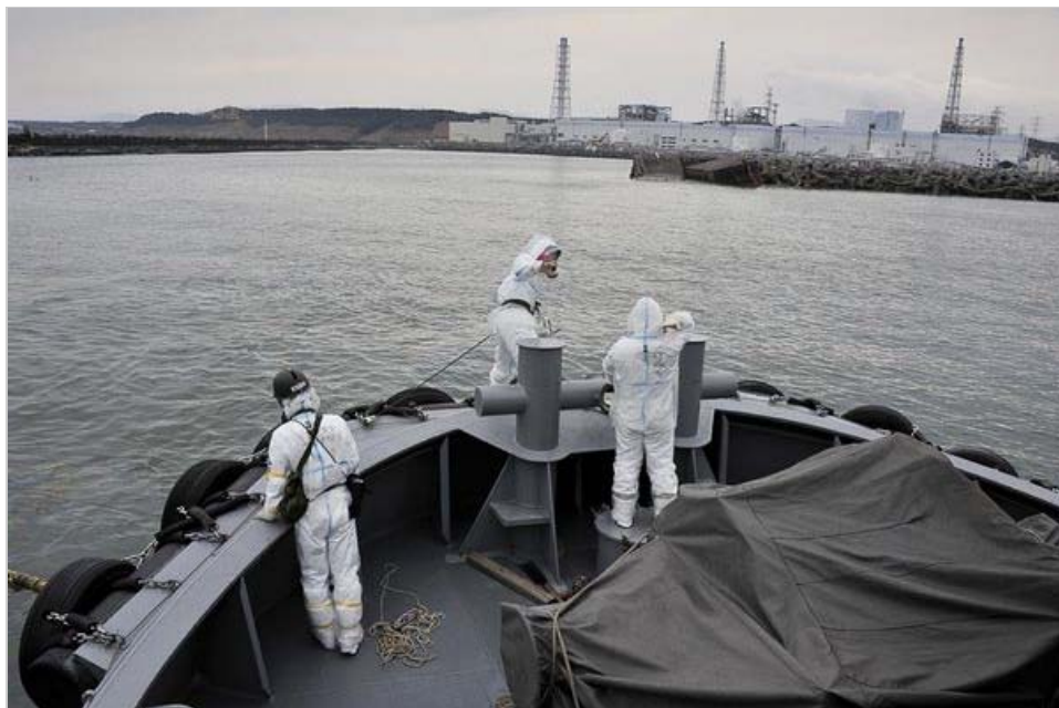
Aboard a boat pulling a barge with water for Japan's overheating Fukushima nuclear plant Thursday.

More radiation from nuclear plant could cause "bizarre mutations."