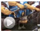
Bird-Safe Oil Spills?