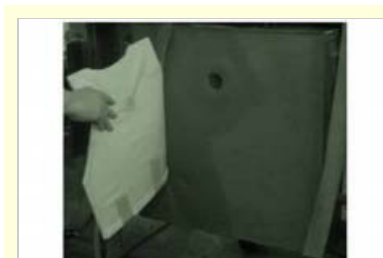
Fibertect decontamination cloth from First Line Technology is now commercially available.