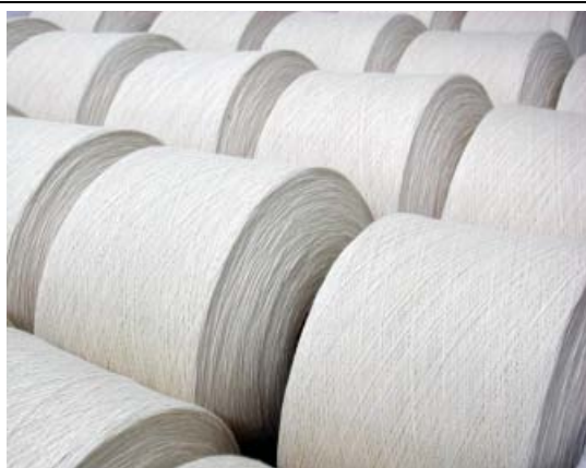
The revised Indian crop estimate for 2010-11 was recently released by the CAB

On January 6, India's Cotton Advisory Board (CAB) released its revised cotton production estimate for the 2010-11 season. India's cotton production is estimated to be 32.9 million bales (170 kg each). This is 400,000 bales higher than the board's August estimate of 32.5 million bales. All India yield is expected to be averaging about 505.92 kgs/ha.