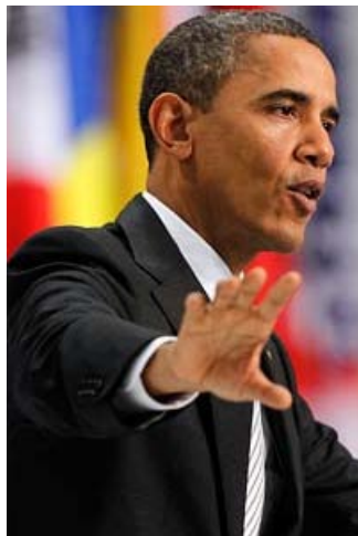
Markus Schreiber, AP